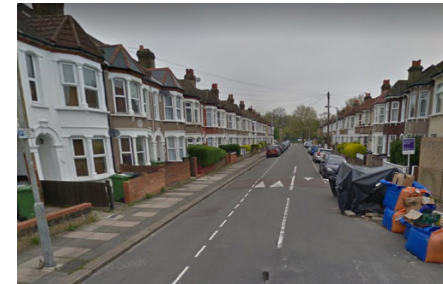
Before and after: Silvermere Road

Trees are living, breathing, greening, shading, hard working nature. They bring joy and colour and make our streets happier and healthier for all. "A street without trees is like a party without music" - local resident.