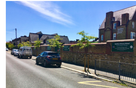
Rathfern School's new trees; A happy waterer at Coopers Lane Primary School