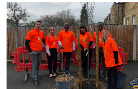
The Regular Cleaning team planting yet more street trees!

Following an internal sustainability initiative to reduce paper consumption, local company Regular Cleaning has become a permanent sponsor of STfL and aim to plant 10 street trees a year, giving back to the local community.